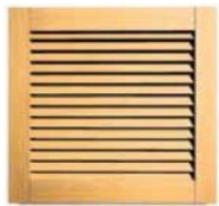
Louvre Open or Closed

● Available in Paint Quality, Paint Quality Cedar, YCedar, Cedar and Rosewood. *18mm MDF for all Paint Quality Interior Doors. Timber panels available on request.