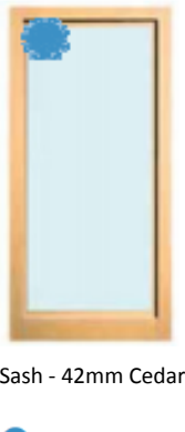
Sash - 42mm Cedar

S5/S6 Frame & Ledge Paint Quality doors made with 17.5mm V-Groove Ply (100mm increments) and Stain Quality doors made with 19mm TG&V (85mm face).