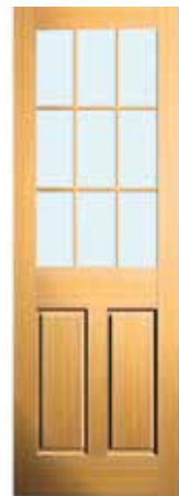
Lumley PQ $878 Cedar $1307