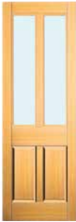
Blair GT PQ $740 Cedar $1197