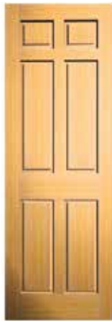
Bolton PQ $936 Cedar $1467