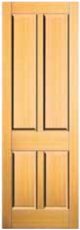
Blair PQ $898 Cedar $1348