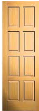
Durham PQ $1116 Cedar $1709