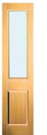
Blair GT Side Lite PQ $498 Cedar $764