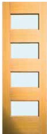
Oxford PQ $707 Cedar $1023