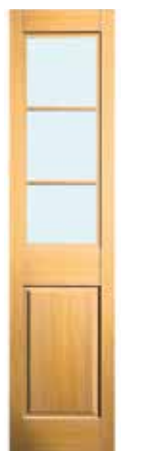
Lumley Side Lite PQ $572 Cedar $833