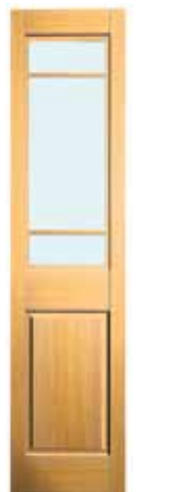
Whitehall Side Lite PQ $572 Cedar $833