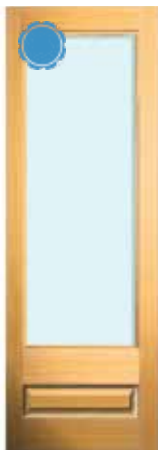
Summerset PQ $614 Cedar $965