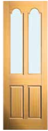
York PQ $824 Cedar $1289