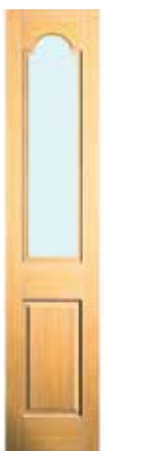
York Side Lite PQ $587 Cedar $881