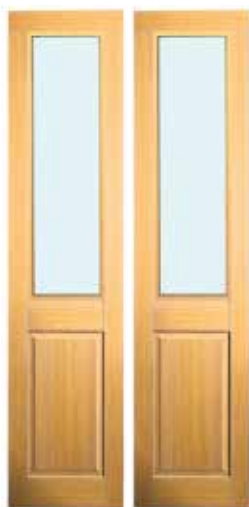
Rhone 610 - 1020

● ● Available in Paint Quality, Paint Quality Cedar, Kauri and Cedar. Rimu pricing and availability on request. Doors under 560mm wide – single panel configuration.