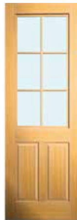
Chelsea PQ $741 Cedar $1134