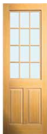
Mayfair PQ $834 Cedar $1229