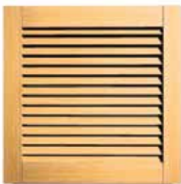
Louvre Open or Closed

● Available in Paint Quality, Paint Quality Cedar, Kauri and Cedar. Rimu pricing and availability on request.