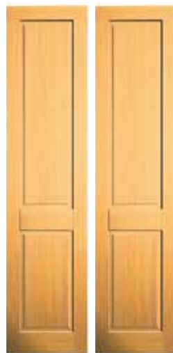
Raglan 610 - 1020