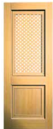
Lansdowne II Lattice

PQ $824 Kauri $1020 Cedar $1584 Lattice 45° Angle.