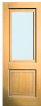
Lansdowne II Glass