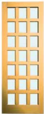
Traditional 7 Lite