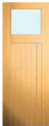
S6 Frame & Ledge