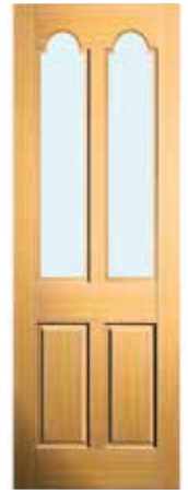
York PQ $763 Cedar $1194