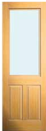
Kew PQ $638 Cedar $956