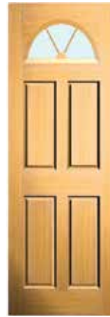
Rising PQ $1210 Cedar $1724