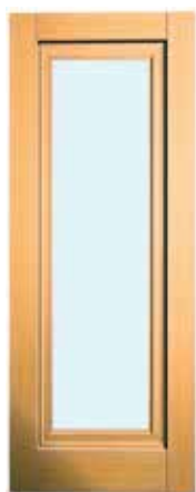
Lansdowne I Glass