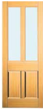
Heritage 3 Glass