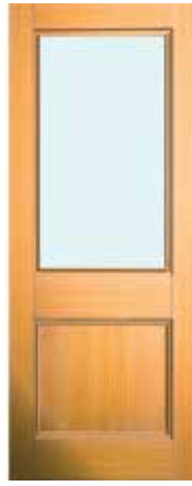
Victorian II Glass