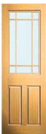
Whitehall PQ $761 Cedar $1193